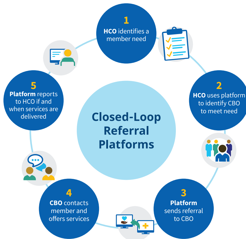
Exhibit 1. Data Flows for HCOs

This process enables the HCO to ensure their members are actually accessing resources and track which CBOs are able to respond in a timely fashion to members' needs. Interviewees noted that closed-loop referral systems were the most desired function in a community resource and referral platform. Correspondingly, most platforms offer a closed-loop referral system; however, some interviewees reported that these closed-loop